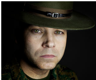
The 5 Dumbest Things to Do If You're in Debt