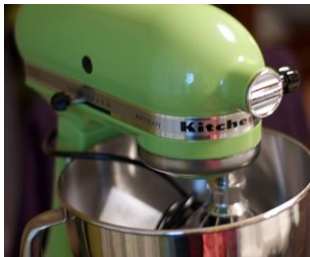
Must Have Appliances Being Sold For Next To Nothing