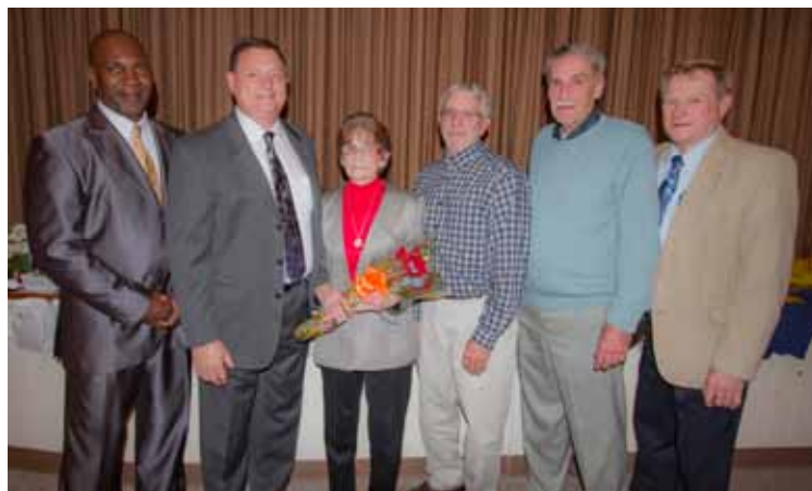
Above right: The Legends Dinner.