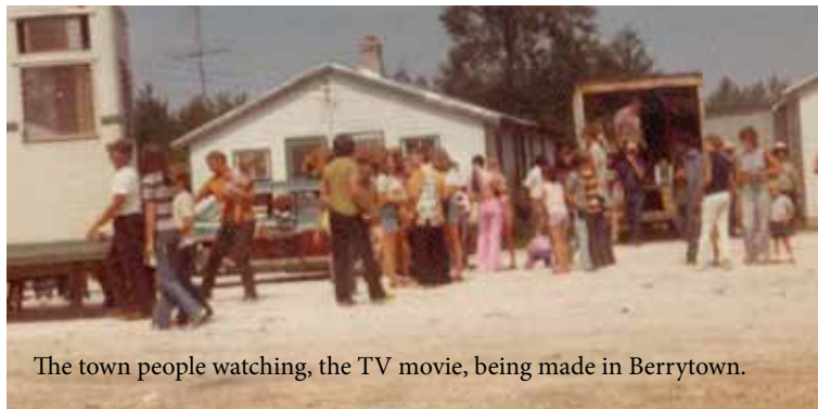
The town people watching, the TV movie, being made in Berrytown.

See all the images and autographs at historicportnorris.org/migrants.htm