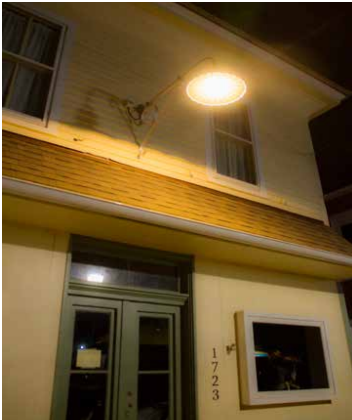
PNHS Meeting Hall