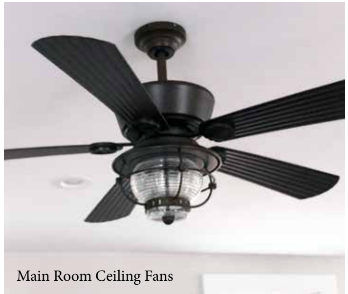
Main Room Ceiling Fans

Your continued support is always welcomed. Donate