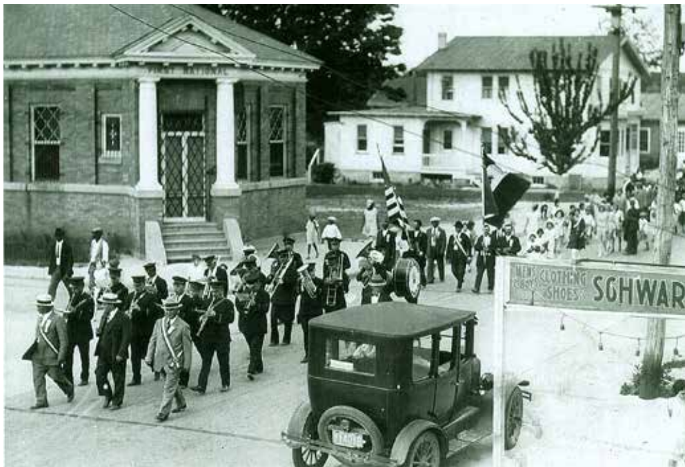
Saint Anthony's Parade on Main Street with the Bank in the background. 1930's

The bank was organized on October 26, 1910 and was issued #10036 for its National charter. Between 1910 – 1933 the bank issued $460,630. In National currency. The bank issued $5's, $10's, and $20's in both the old large size format (3" x 7 ½") from 1910 – 1929; then in 1929, the currency was changed to the small size format that we use today.