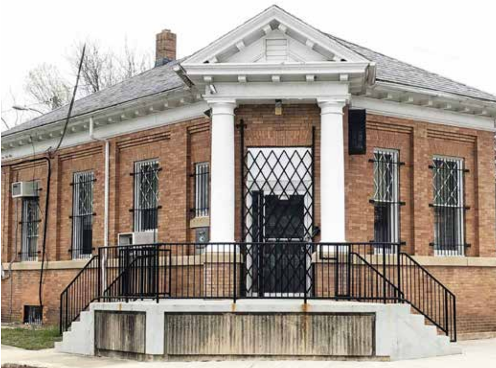
The bank is today is privately owned.

Sun National Bank in Port Norris to close Aug. 27, 2010.