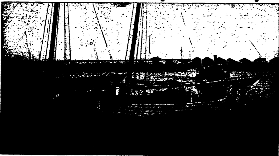
BOAT SCENE AT BIVALVE