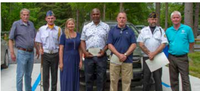
Commercial Township Veterans Memorial Park Committee