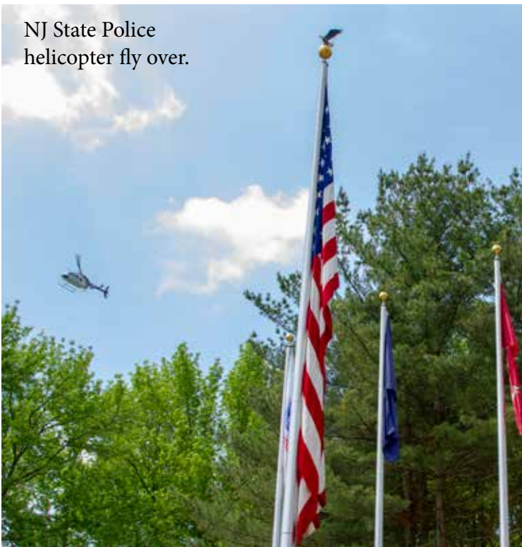
NJ State Police helicopter fly over.